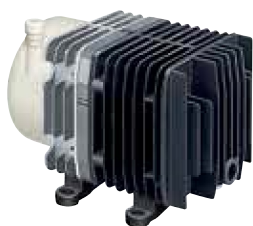
AC0610 / AC0610A