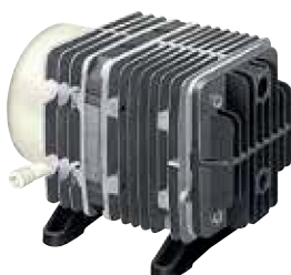
AC0910 / AC0920