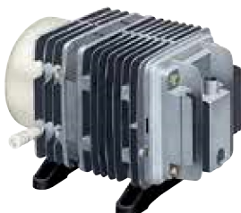
AC0901 / AC0902