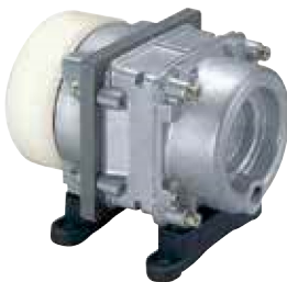
AC0301A / AC0401A