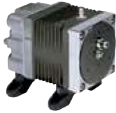
VP0125 / VP0140